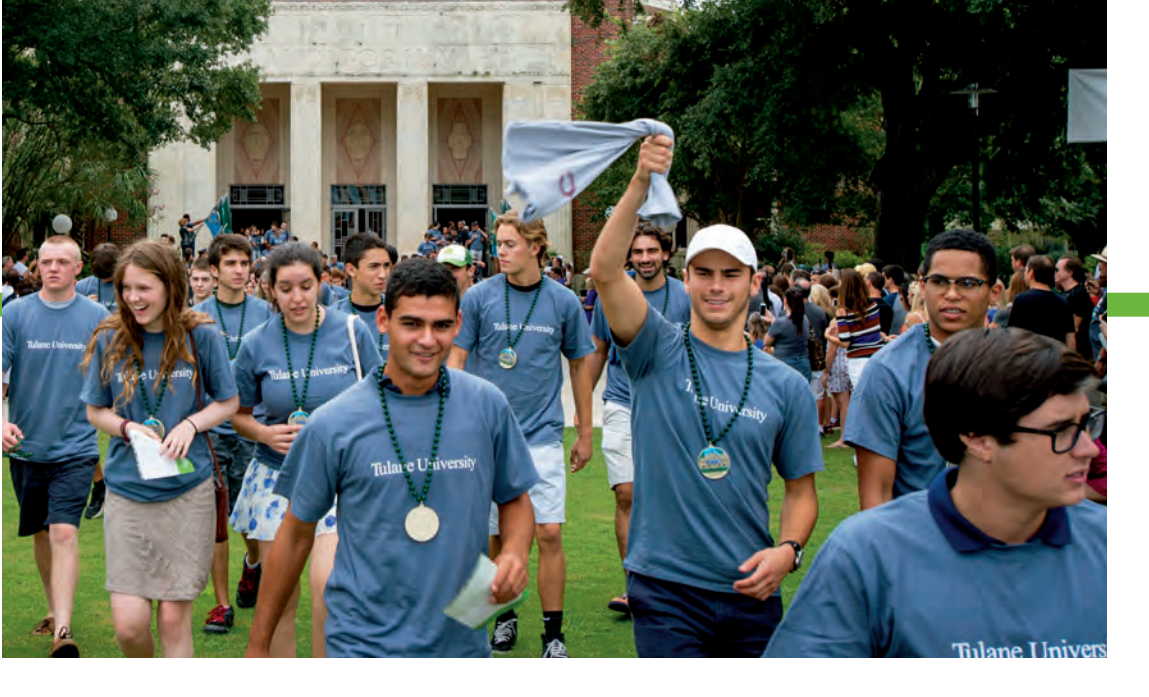
Students celebrate after the President's Convocation for New Students on Aug. 27. The incoming class is the largest in Tulane's history—and the most academically qualified.